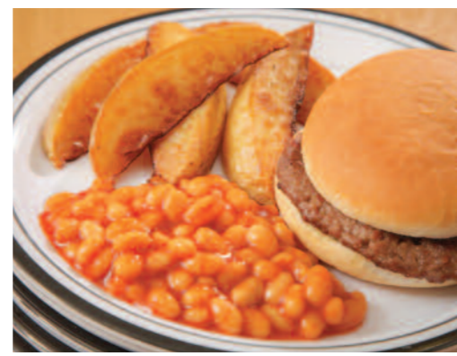
Beef Burger served in a Bun with Potato Wedges & Seasonal Vegetables or Baked Beans