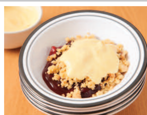
Fruit Crumble & Custard