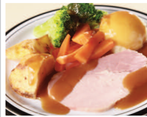
Honey Roast Gammon served with Roast/Mashed Potatoes, Seasonal Vegetables & Gravy