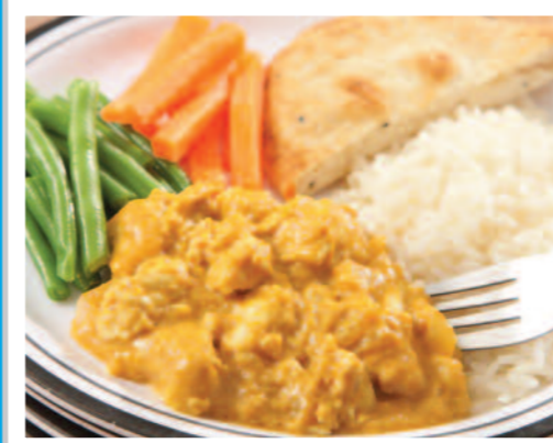
Chicken Korma served with Rice, Naan Bread & Seasonal Vegetables