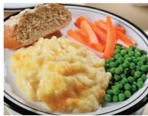
Mac 'n' Cheese served with Garlic & Herb Bread and Seasonal Vegetables