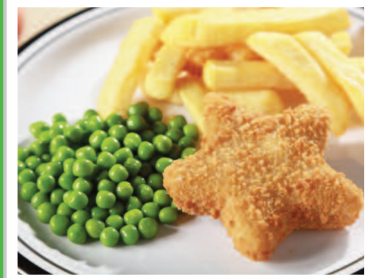
Fish Star (MSC) served with Chips & Peas or Baked Beans