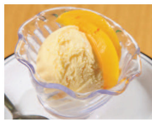
Ice Cream & Fruit