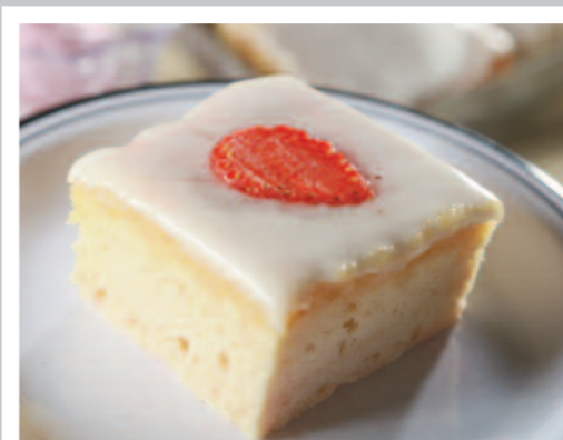
Strawberry Ice Cream Cake