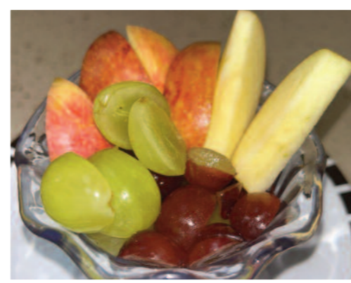
Apple & Grape Pot