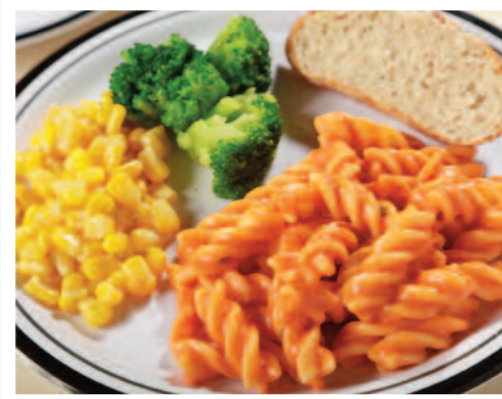
Tomato & Mascarpone Cheese Pasta served with Garlic & Herb Bread and Seasonal Vegetables