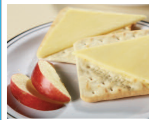
Cheese & Crackers