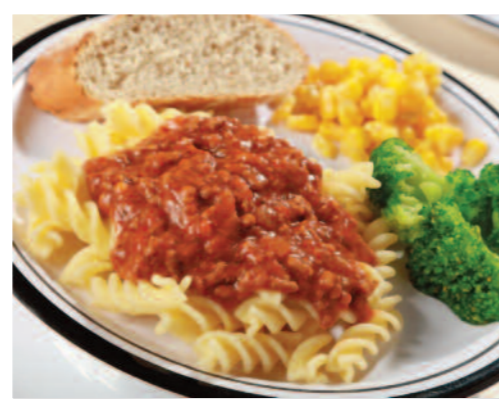
Pasta Bolognese served with Garlic & Herb Bread and Seasonal Vegetables