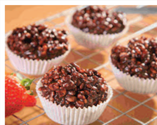
Chocolate Crispy Cake