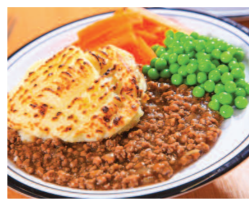
Cottage Pie served with Seasonal Vegetables