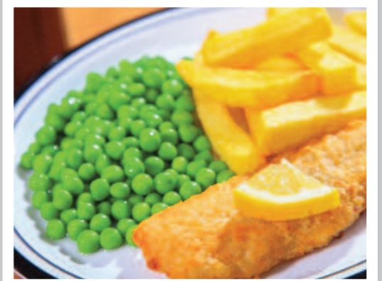
Battered Fish (MSC) served with Chips & Peas or Baked Beans