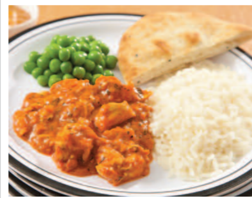
Chicken Tikka Masala served with Rice, Naan Bread & Seasonal Vegetables