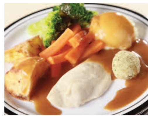
Roast Chicken served with Roast/Mashed Potatoes, Seasonal Vegetables & Gravy